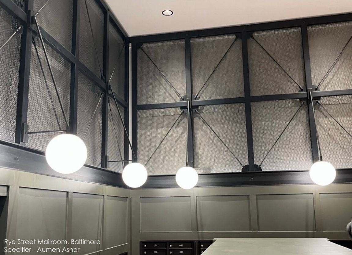
Rye Street Mailroom, Baltimore Specifier - Aumen Asner