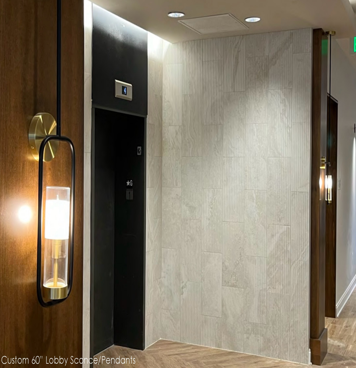
Custom 60" Lobby Sconce/Pendants