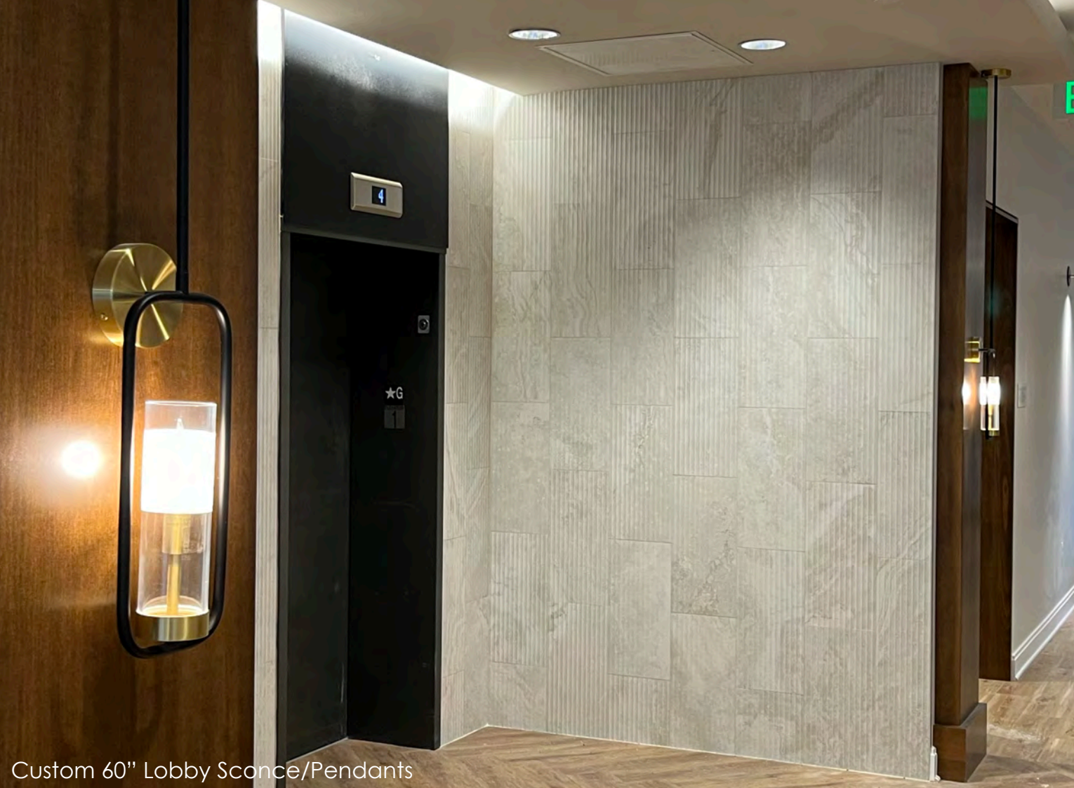
Custom 60" Lobby Sconce/Pendants