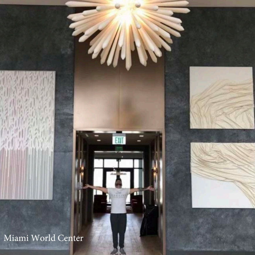
Miami World Center